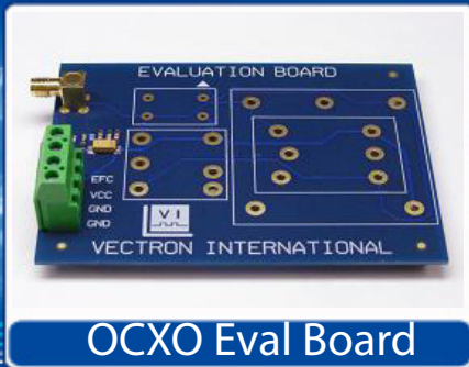
OCXO Eval Board

Helping Customers Innovate, Improve & Grow